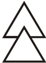
IEC 61482-2:2009 EBT50 = 9.6cal/cm 2

It is not designed to protect against molten aluminium and iron splash (Code Letters D and E).