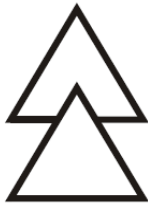
IEC 61482-2:2009 ATPV = 9.6cal/cm 2

It is not designed to protect against molten aluminium and iron splash (Code Letters D and E).