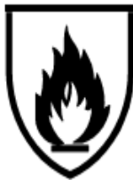
EN ISO 11612:2015 A1 B1 C1