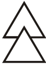
IEC 61482-2:2009 ATPV = 10.5cal/cm 2

The use of this garment fulfils the requirements for clothing capable of signalling the user's presence visually, intended to provide conspicuity of the wearer in hazardous situations under any light conditions by day and under illumination by vehicle headlights in the dark.