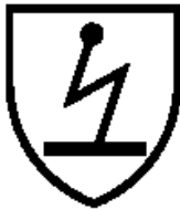
EN 1149-5:2008 EN 1149-3:2004